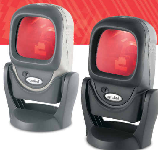
2005 Sunrise Date Compliant

In many applications, the feature-rich LS 9208 presentation scanner offers aggressive performance, maximum durability and optimal ergonomics to create a more productive POS environment. When you buy the LS 9208, you receive the added assurance of purchasing from Symbol—a company with proven solutions and millions of scanner installations worldwide.