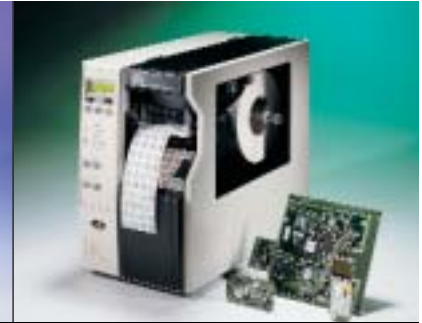
96 XiIIIPlus ™

With a print resolution of 600dpi—the 96 XiIIIPlus —is unmatched at printing precise bar codes, text and graphics information in limited label space. This printer is ideal for applications that require extremely high resolution—labeling electronic components, telecommunication assemblies, computer peripherals, small pharmaceutical packaging, diagnostic research samples, and more.