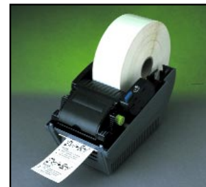
500 foot media roll option.

Del Sol is the most versatile desktop printer on the market with leading edge power, performance, and a low price point.