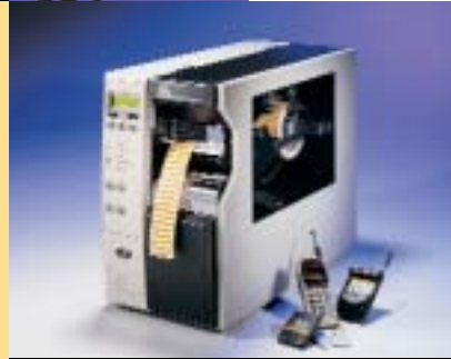
90 XiiiPlus ™

The 90 XiiiPlus printer is ideal for applications that require small, high-resolution bar code labels, such as tracking printed circuit boards and small parts, and identifying small products. The printer's standard 300dpi printhead ensures text, graphics and bar codes always print clearly—essential when label space is limited.