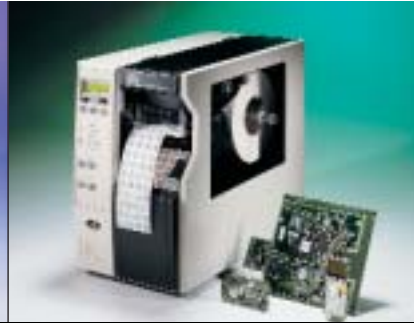
96 XiiiPlus ™

With a print resolution of 600dpi—the 96 XiiiPlus —is unmatched at printing precise bar codes, text and graphics information in limited label space. This printer is ideal for applications that require extremely high resolution—labeling electronic components, telecommunication assemblies, computer peripherals, small pharmaceutical packaging, diagnostic research samples, and more.